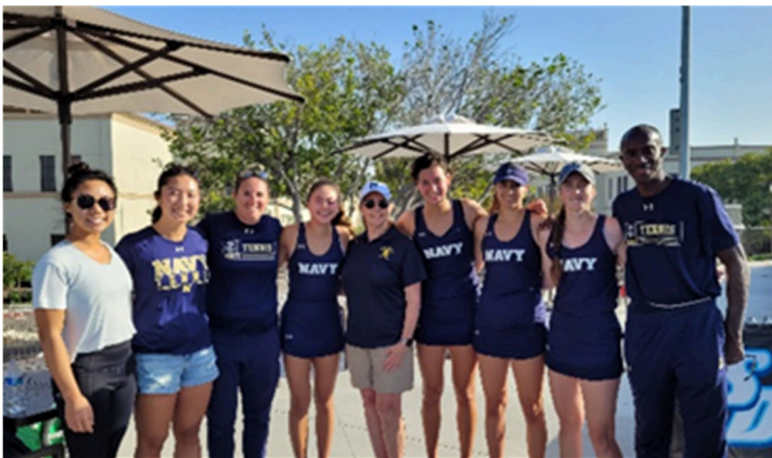
U.S. Naval Academy Women's Team