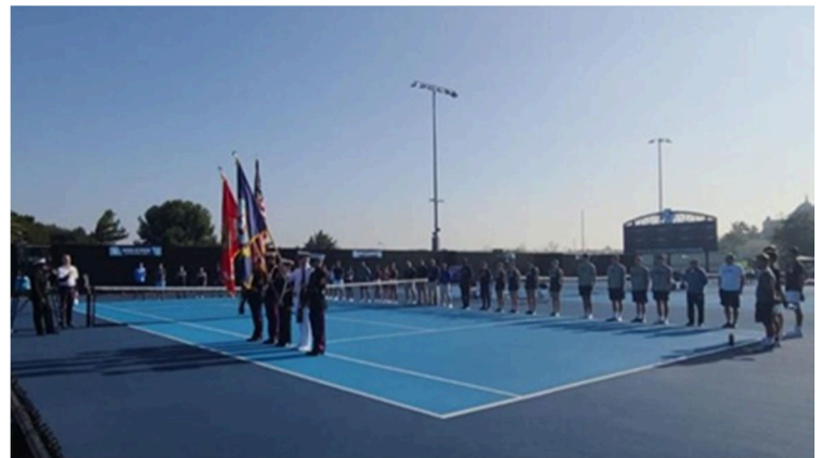
Opening ceremonies led by USD Naval ROTC Color Guard