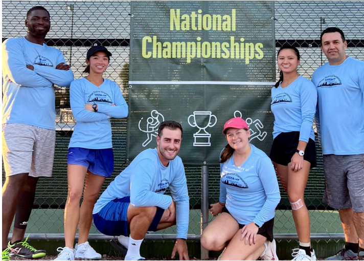
University City Racquet Club took 3rd place in the Nation in 10.0 Mixed Doubles!

We are in the swing of National Championships season and proud to say that we have 9 teams this year from San Diego representing all of Southern California. Read all about their journeys in our SDDTA Tennis Yearbook coming in January!