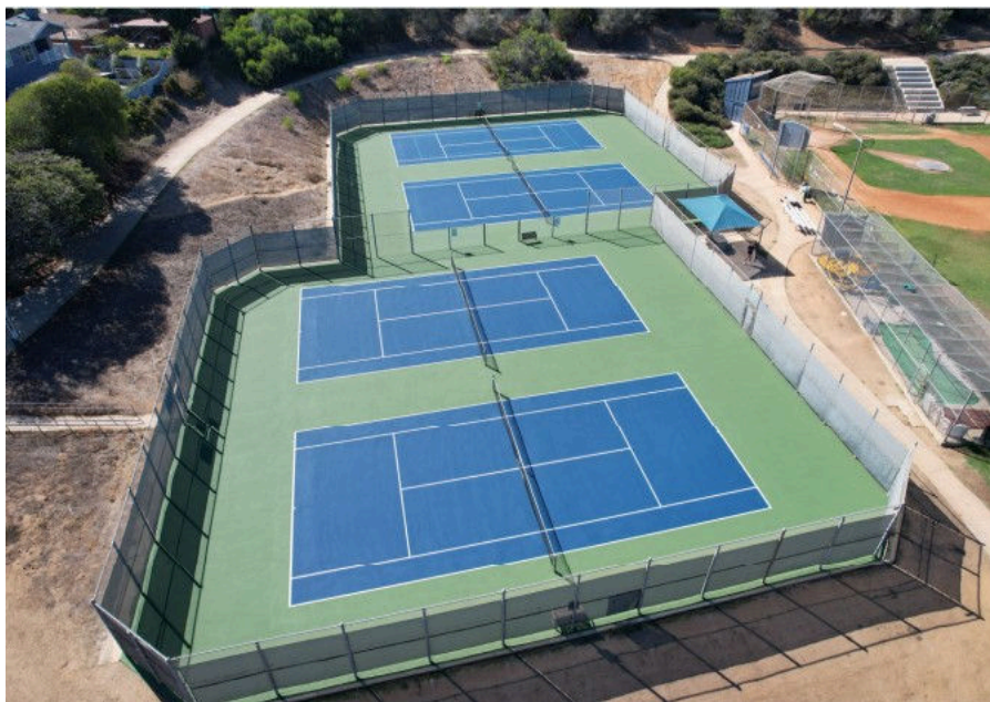
Four newly resurfaced courts at Point Loma Cabrillo Tennis Club

The Greater San Diego City Tennis Council (GSDCTC) completed two projects in 2022. The first was installation of LED lighting on the remaining three of the seven tennis courts at Mountain View Sports & Racquet Club. The lights were turned on in February.