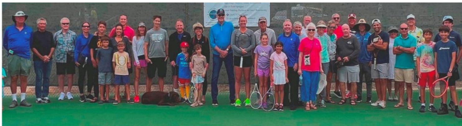
Clinic participants at Point Loma Cabrillo court reopening.