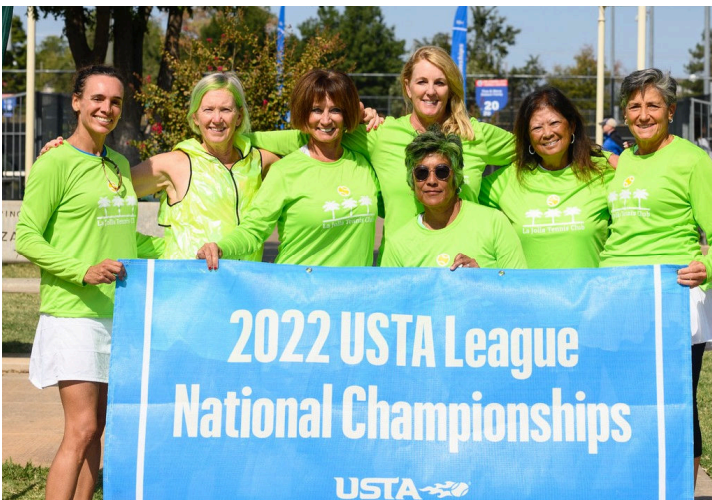
La Jolla Tennis Club's 40 & Over 4.0 women finished 6th out of over 2600 teams Nationally in the 40 & Over division.